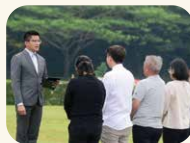
最后道别 Final farewell conducted.