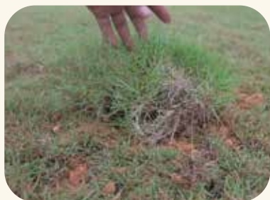
礼成 Ceremony completion.