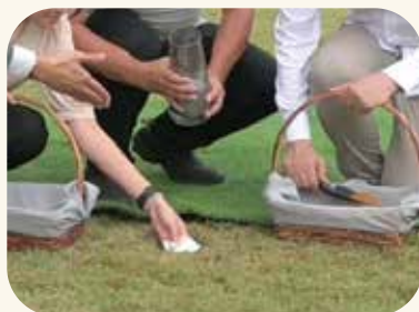
献花 Flowers are then offered.