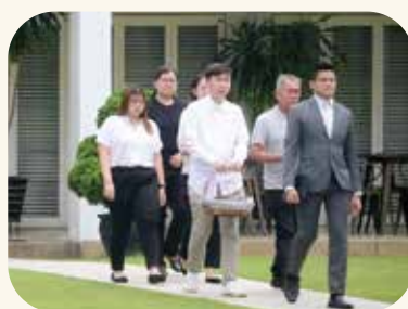
前往植存园区 Go to Eco Burial Garden.