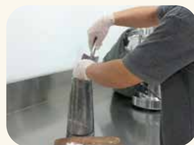
装进容器里 Packaged into container.