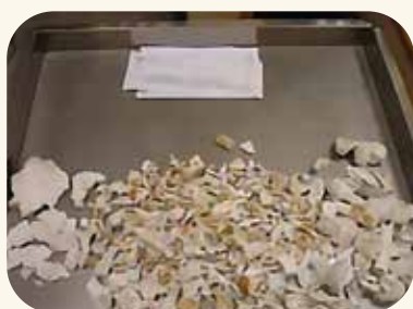
火化后捡骨 Cremation and collection of ashes.