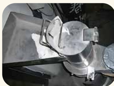
骨灰研磨 Ground into powder.