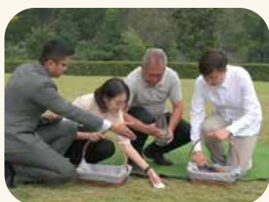
由3名家属进行仪式 3 family members invited to bury the ashes.