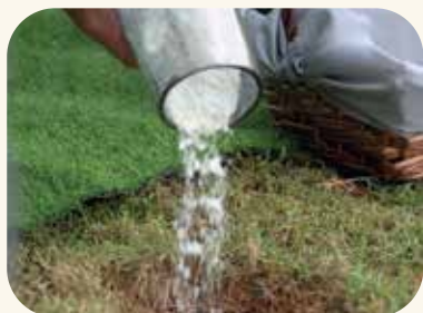
置入骨灰 Ashes poured into the hole.