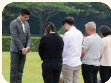
致以最后的敬意 Pay last respect.