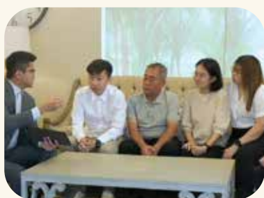
礼仪师向家属讲解流程 Breifing to the family of burial process.