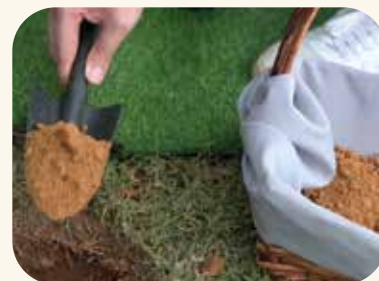
覆土 Hole is then fill up with soil.